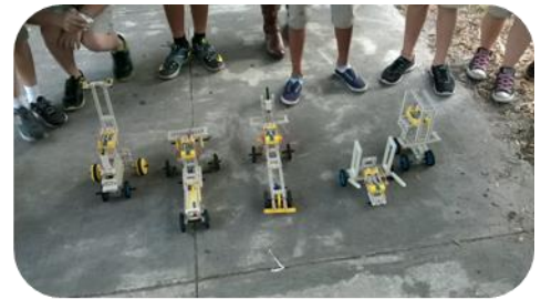
Table 4- Jaden "It was a bit frustrating because we couldn't get the car to run and it started to break because it was too heavy". The car project was a combination of interesting and fun moments. By Ariana

Table 3- Tyler "It was successful some of the time. I think it was fun".